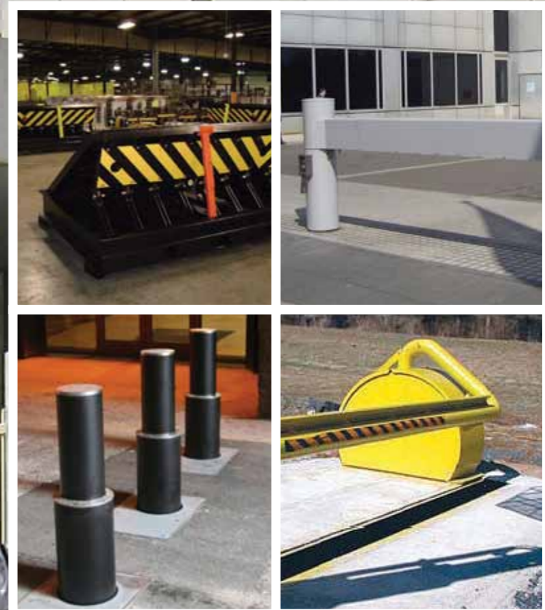
112mm/ 4.409in The actual depth of our super shallow foundations.